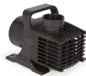
TT6000 Page 13