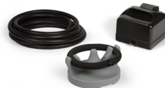
TADKIT1800 Page 10