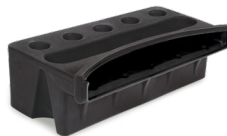
SP2600 Page 12