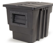
PS7000 Page 11