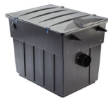
BioTec ScreenMatic² 24000 Page 8-9