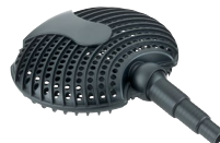
AquaMax Satellite Pre-Filter Page 6